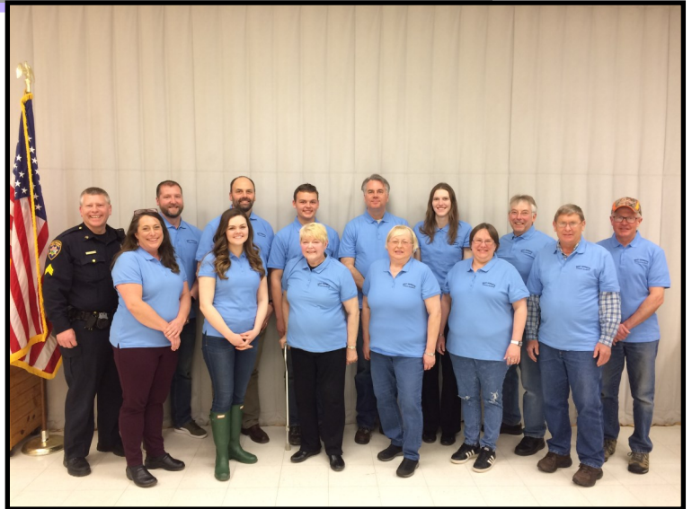
2018 Citizens Academy Graduation Class

West Hennepin Public Safety has announced the dates for the 2019 Citizens Police Academy. The Citizens Police Academy will start on February 14, 2019 and will end with graduation on April 4, 2019. The Academy runs for eight weeks, one day a week, Thursday nights, from 7:00 p.m. to 10:00 pm.