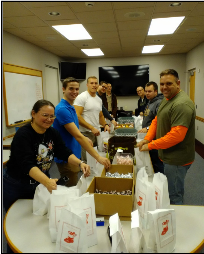
WHPS Reserves prepare for the "View Santa Event"

On Saturday December 1, 2018 the West Hennepin Public Safety Reserve Officers hosted the popular event "View Santa" in Maple Plain and Independence. The Police Reserves escorted Santa in his sleigh around town to visit with and see children throughout many neighborhoods. In doing so they collected food for the Maple Plain Area Food Shelf.