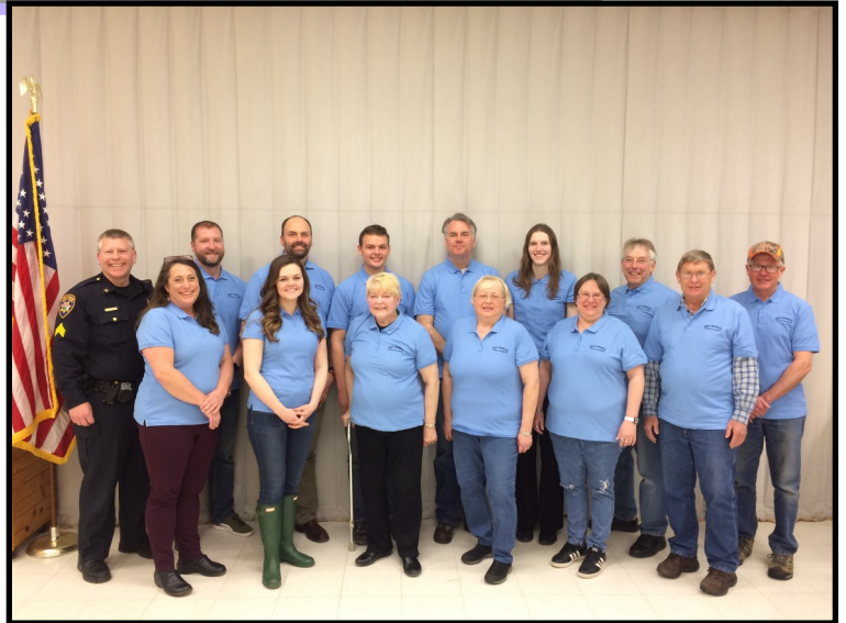
2018 Citizens Academy Graduation Class

West Hennepin Public Safety has announced the dates for the 2019 Citizens Police Academy. The Citizens Police Academy will start on February 14, 2019 and will end with graduation on April 4, 2019. The Academy runs for eight weeks, one day a week, Thursday nights, from 7:00 p.m. to 10:00 pm.