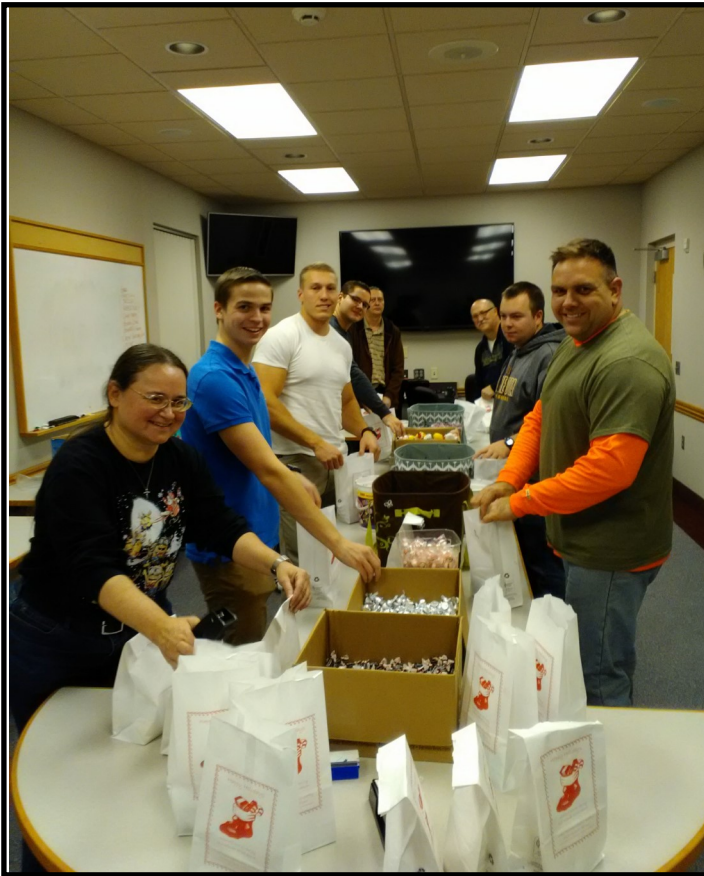
WHPS Reserves prepare for the "View Santa Event"

On Saturday December 1, 2018 the West Hennepin Public Safety Reserve Officers hosted the popular event "View Santa" in Maple Plain and Independence. The Police Reserves escorted Santa in his sleigh around town to visit with and see children throughout many neighborhoods. In doing so they collected food for the Maple Plain Area Food Shelf.