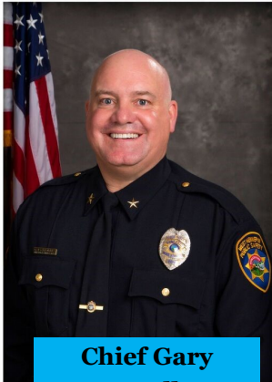
Chief Gary Kroells

Scams and scam artists have been around for centuries. Many of today's scams are perpetrated by criminals who are bent on stealing people's money. Most of these criminals live in other states or countries and are using modern technology to avoid detection from law enforcement. These suspects are very difficult, if not impossible, to locate and prosecute for these crimes.