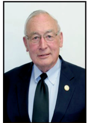
Mayor Marvin Johnson

Our most pressing concern is getting back to normal with our road system. The detours for U. S. Highway 12 have been removed and hopefully traffic is flowing normally. County Road 92 from Lyndale to St. Boni will remain (Continued p.2)